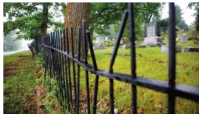
A lack of maintenance funds caused by alleged misconduct has hurt the upkeep and maintenance of some area cemeteries.